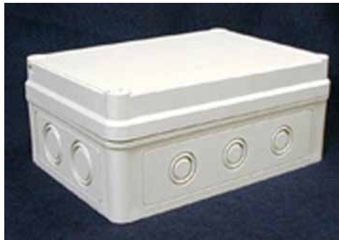
Optional Sentry 50 Vynckier enclosure 7" x 5" x 3" (or 7" x 7" x 3") UV Stable Polycarbonate